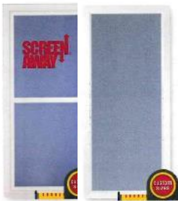
Fullview Clear 146FV